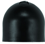
6LV1352 Light Shield for Button Photocontrol (K4000 Series, K4321, K4400 Series, EK4036S, EK4336S, EK4436SM)